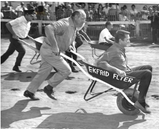
Wheelbarrow Races at Glencoe Fair