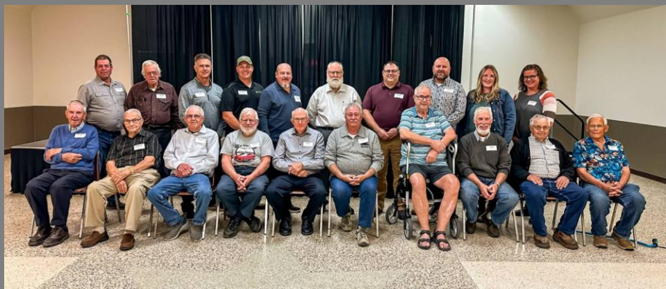
Past Presidents of the Glencoe Agricultural Society.