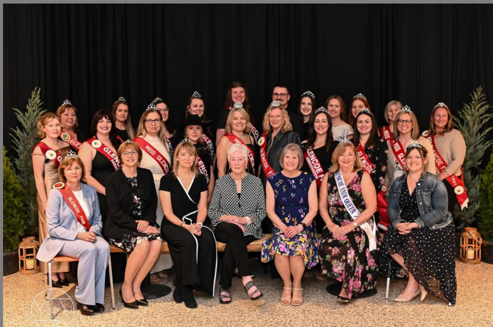
Past Fair Queens and Ambassadors of the Glencoe Agricultural Society.