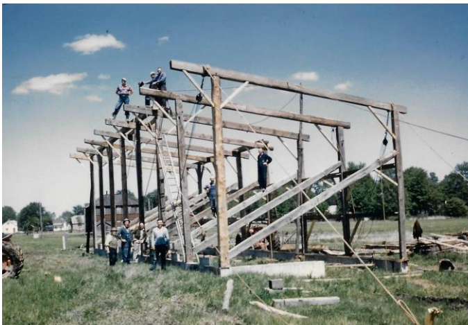
Rebuilding grandstand June 1957.

One unique Jam or Jelly Not Mentioned Above. Judges Choice! Recipe Must Be Attached. Fair to Receive 1st Place Jam or Jelly.